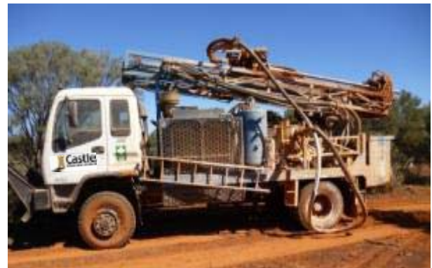
Castle's Ghana Projects (left) and above the Company's new multipurpose drill rig now operating at the Baayiri prospect.